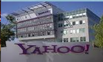
Head Office In U.k