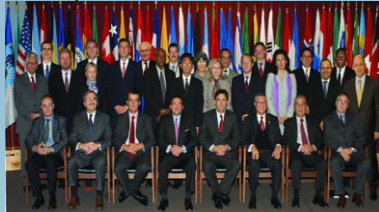
Lottery Board of Executive Directors